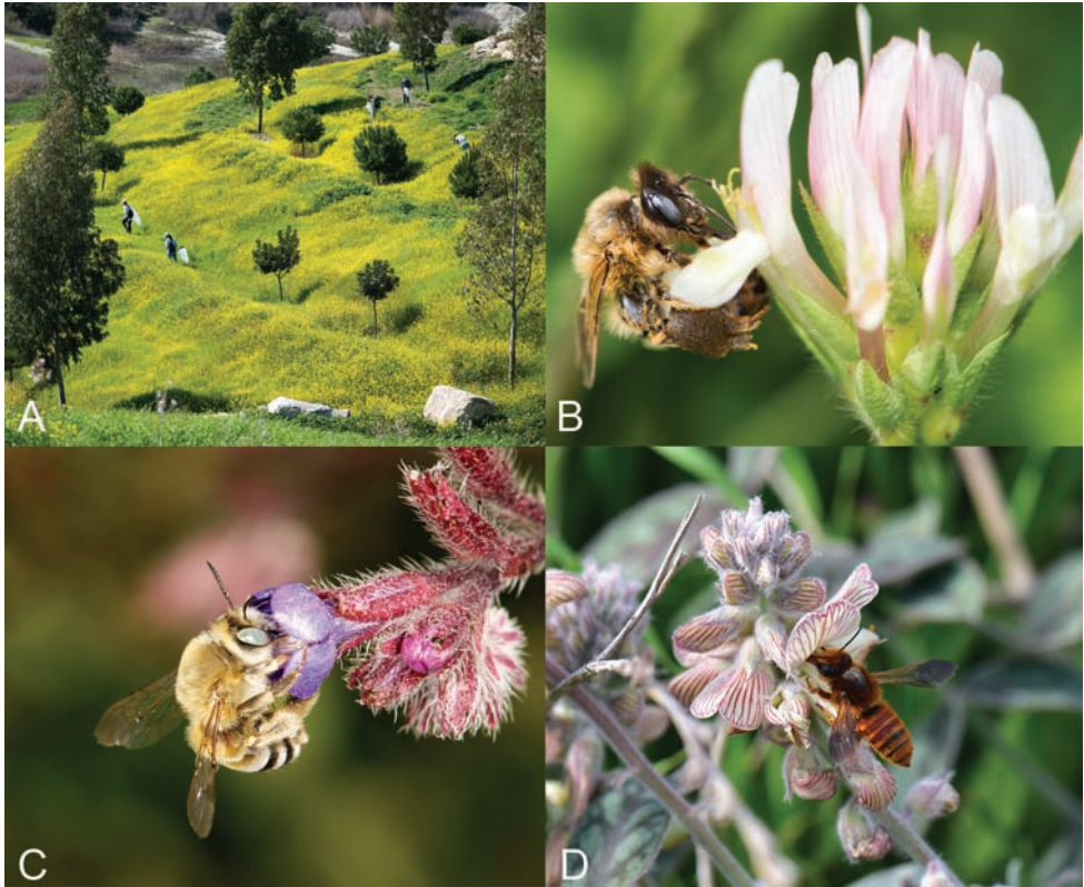
Figure 2. A Landscape with diverse bee fauna in Cyprus (Yermasoyia Dam area) B Melitturga syriaca foraging on Trifolium clypeatum C Eucera dimidiata foraging on Anchusa undulata subsp. hybrida D Megachile cypricola foraging on Onobrychis venosa .