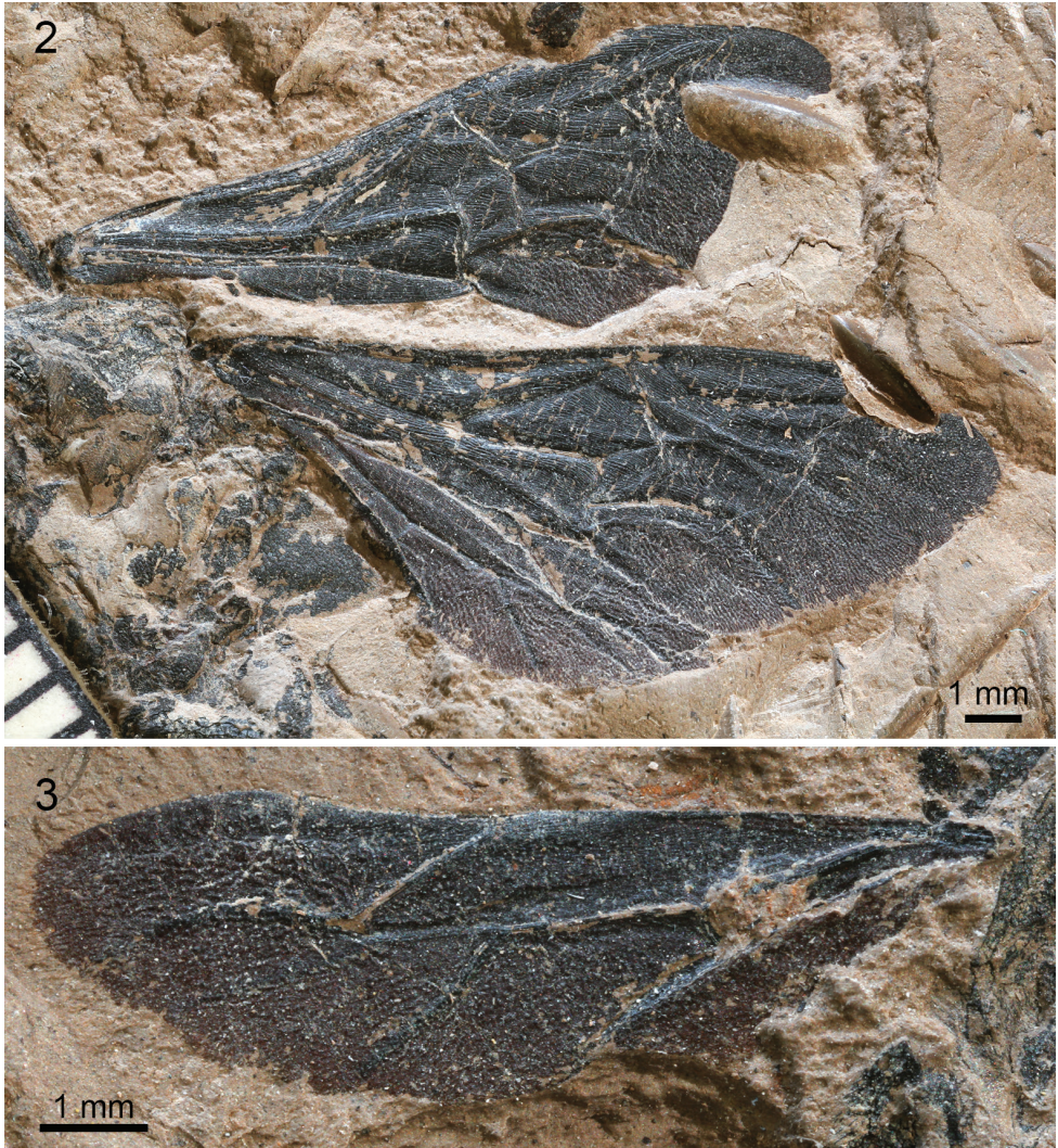
Figures 2–3. Photographs of wings of holotype of Bombus ( Cullumanobombus ) trophonius , sp. n. 2 Left forewing and right forewing and hind wing 3 Right hind wing.

fifth of length. Hind wing length 9.4 mm, width 2.6 mm (Figs 3, 6). Preserved portion of thorax and legs difficult to discern and interpret, although portion of metatibial corbicula preserved (basal quarter to third), and most sclerites with numerous, long setae.