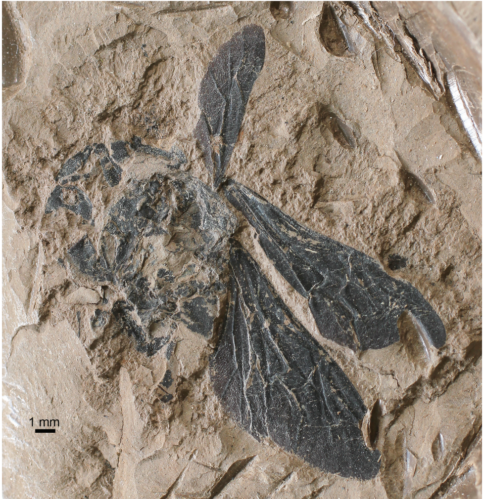
Figure 1. Photograph of holotype of Bombus (Cullumanobombus) trophonius , sp. n., from the Early Miocene of Bílina Mine in northern Bohemia, Czech Republic.

much more than vein width, not appendiculate; 2Rs strongly arched basally and then gently arched outward, giving second submarginal cell distinct proximal extension; r-rs about as long as 3Rs; 4Rs only slightly longer than 3Rs; three submarginal cells of comparatively similar sizes, albeit third slightly larger than first or second; first submarginal cell length 0.9 mm, width 1.0 mm; second submarginal cell length 1.3 mm, width 0.9 mm; third submarginal cell length 1.6 mm, width 1.2 mm; 1rs-m straight, comparatively orthogonal with Rs; 2rs-m arched distally in posterior half; 1m-cu distinctly angulate anteriorly near M, entering second submarginal cell near cell's midlength; 2m-cu weakly and gently arched apically, meeting third submarginal cell at cell's apical