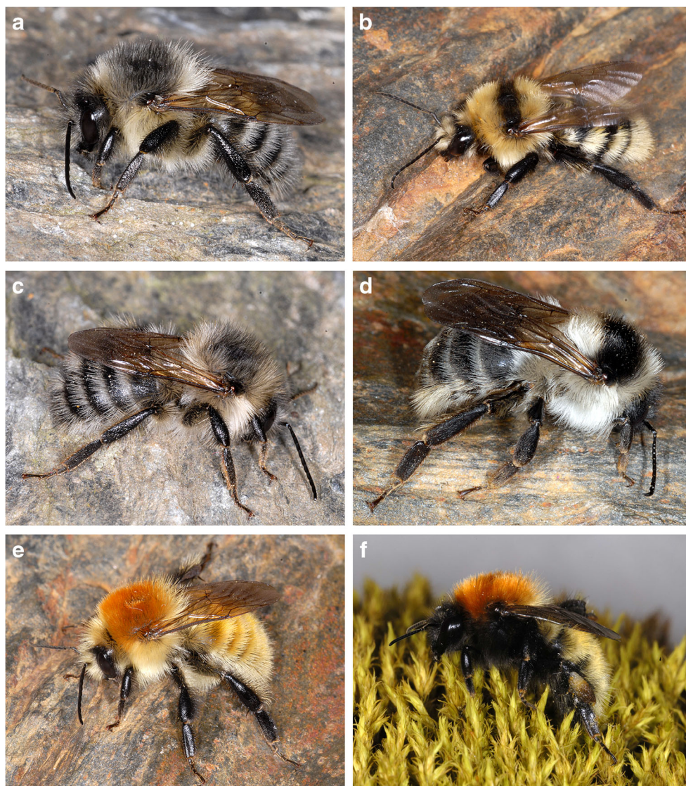
Fig. 1 a Bombus deuteronymus superequester from Mongolia. b B. filchnerae from Mongolia. c B. humilis subbaicalensis from Mongolia. d B. exil from Mongolia. e B. muscorum muscorum from The Netherlands. f B. muscorum liepetterseni from Norway.

In this study, the variability in CLGS of four East-Palearctic taxa was investigated to question their role in the pre-mating recognition system: Bombus deuteronymus superequester (Skorikov 1914) (Fig. 1a), B. filchnerae Vogt 1908 (Fig. 1b), B. humilis subbaicalensis Vogt 1911 (Fig. 1c), and B. exil (Skorikov 1923) (Fig. 1d) all belonging to the Thoracobombus Dalla Torre 1880 subgenus. Moreover, we compared the CLGS composition of B. filchnerae with that of its nearest Palearctic taxon: B. muscorum (L. 1758) (Fig. 1e, f).