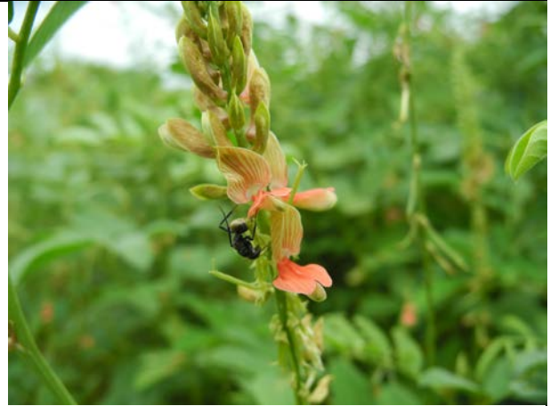
Indigofera cfr schimperi