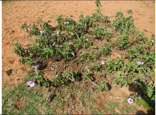
St20) Agere-Maryam, forest 5 km S, 5°29'56.7N 38°15'32.3"E, 1963m, Ocimum lamiifolium .