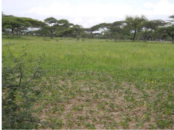
Crops with Asteraceae