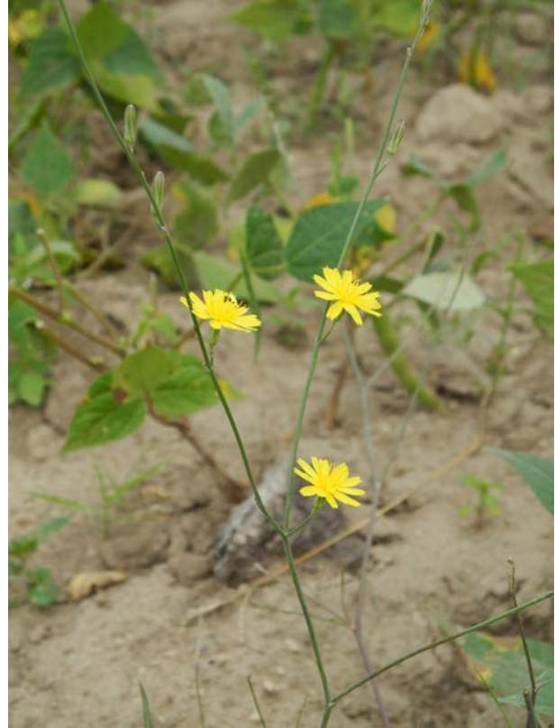
Launea cornuta (Asteraceae)

4b) shore of Lake Shala, 7°27'18.5"N 38°38'18.5"E, 1571m, on Plectranthus , Hypoestes and in crops.