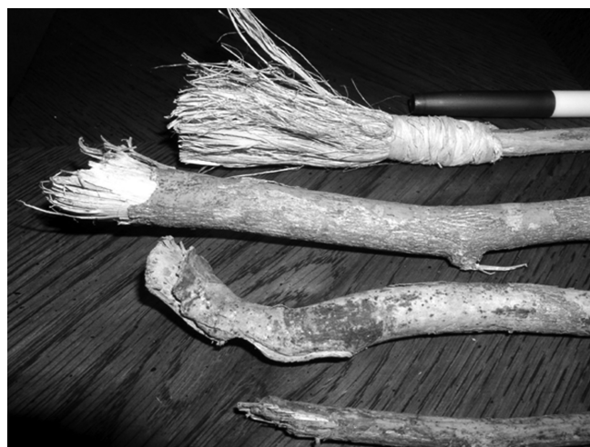
FIGURE 2. The tools used by Chimpanzees and humans to remove honey and food from highly social bee nests. Above is a brush made by indigenous people (Bolivia, courtesy of E. Stierlin and H. Szabo), and below are three woody lianas used by Chimpanzees (courtesy C. Tutin, Lope Reserve, Gabon).

OTHER CAUSES OF MORTALITY. —The bees are under threat from forest fires which usually occur during severe drought. In July 1999